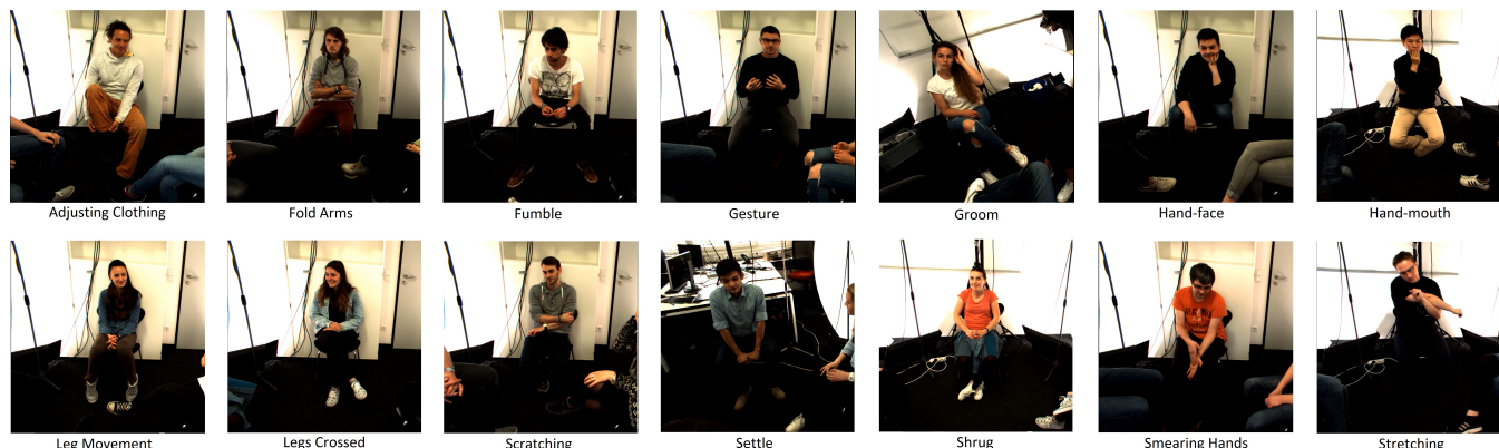
Figure 1: Examples of annotated bodily behaviors.

François Brémond francois.bremond@inria.fr INRIA Sophia Antipolis Sophia Antipolis, France