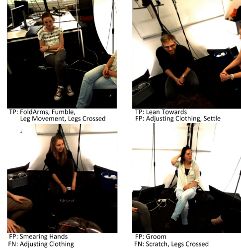
Figure 4: Illustrative examples of true positive, false positive and false negative predictions.

In addition to MAP, the evaluation metrics are calculated from the detection confidence vector on the frame level: True Positives (TP) as the sum of confidences in true classes, False Positives (FP) as the sum of confidences in false classes, and False Negatives (FN) as the sum of 1 minus confidences in true classes. From TP, TN and FN on the frame level, we calculate the F1 score globally using both micro and macro averaging. As expected from behavior recognition, Swin achieves the best results with F1 0.728/0.544 and MAP 0.742/0.415